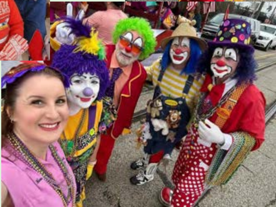
Above Left: Kritter & Yank entertained new students at the Dear Ones Day Care Grand Opening.