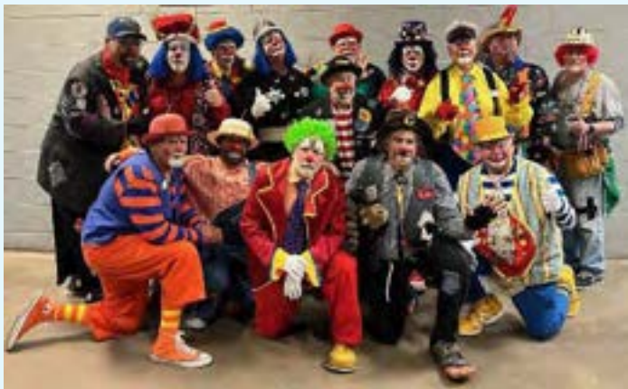
Moslah & India Clowns get together after the Circus for a quick photo