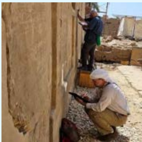
Two Egyptologists from Fort Worth Tx. (standing) who are reading the wall at Luxor Egypt pertaining to Ramses II historical diary.