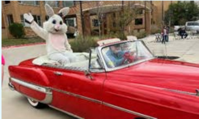
The Easter Bunny arrived in style!