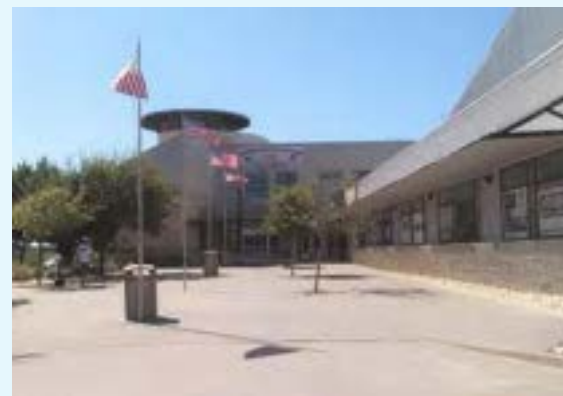
NTX Sports Centre in North Richland Hills will be the venue for Moslah's 81st Shrine Circus