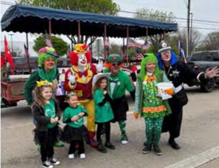
Moslah Clowns entertained the crowd as the floats lined up.

It was a rainy day, but as expected, Moslah showed up! Several units bundled up and made the trek down Main St. to get the fez out in front of the public!