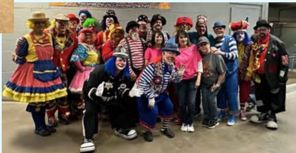
Moslah, Hella and India Shrine Circus Clowns and our ladies pose after the Saturday morning performance.