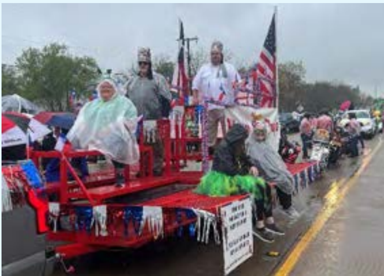
Braving the elements at the Mansfield Pickle Parade