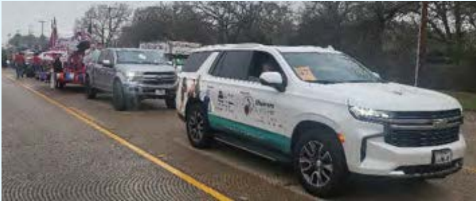
Fezzy rides shotgun in the rain-drenched Pickle Parade