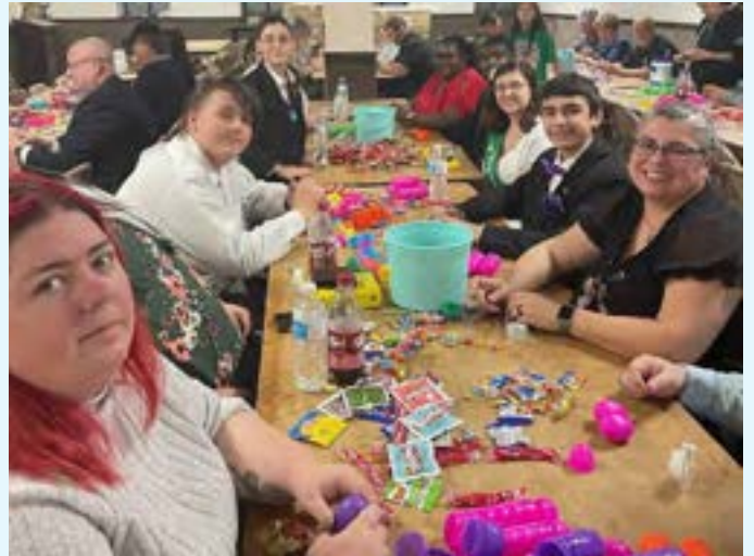
Members of DeMolay and Rainbow Girls donated their time to help with filling over 6,000 eggs for the Egg Hunt