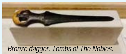
Bronze dagger. Tombs of The Nobles. Belonging to the priest Khema. Notice the Crescent on the handle is a Shrine symbol.

← Inscription on the inner chamber wall of this Egyptian Temple mentions a very famous artifact that is a part of every Blue Lodge.